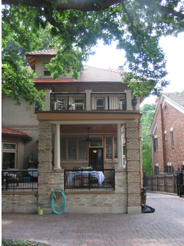
New Porch / Outdoor Dining