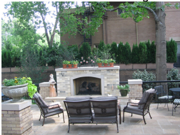
New Outdoor Fireplace