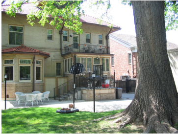
Existing Rear – before