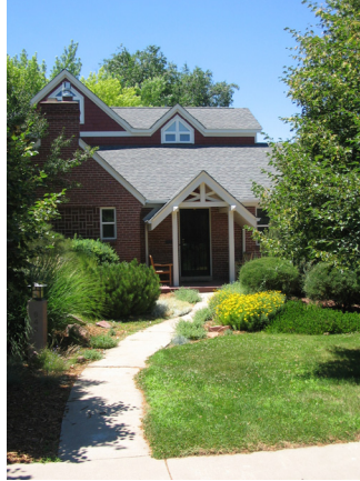
New Addition – East