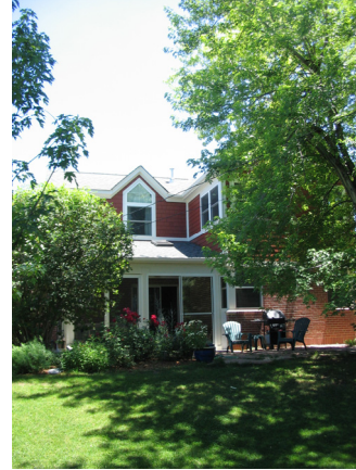
New Addition - West