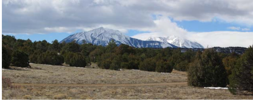
View to southwest